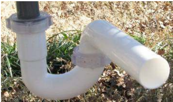
P-trap completely blocked with melted grease

Test 1 – 1-1/2 gpm - Conventional P-trap –Grease